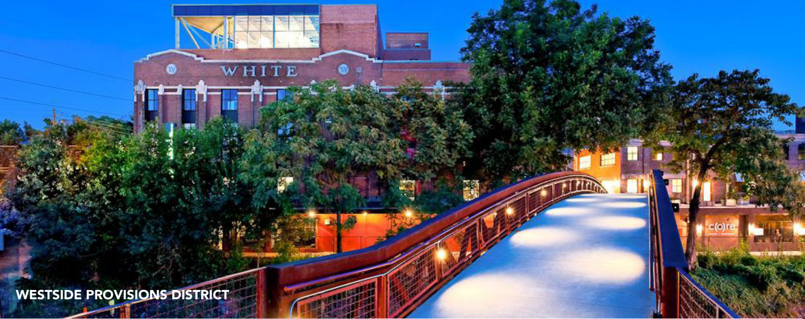
WESTSIDE PROVISIONS DISTRICT