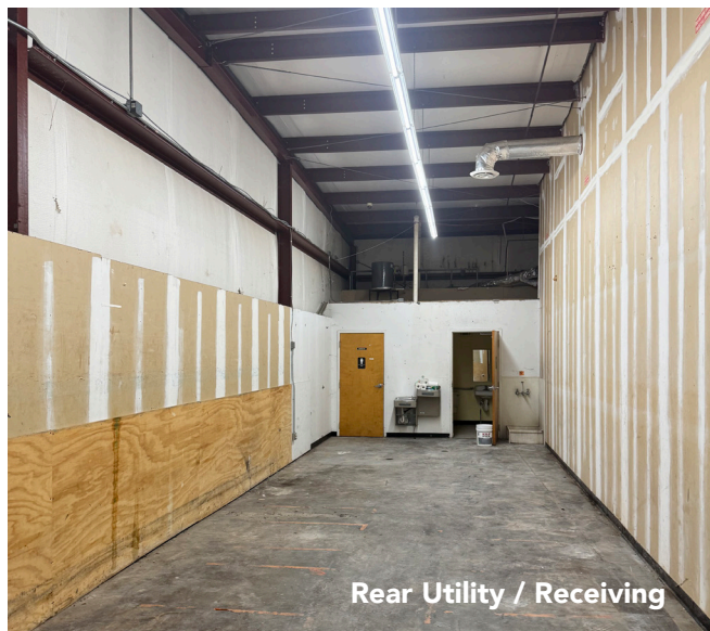
Rear Utility / Receiving