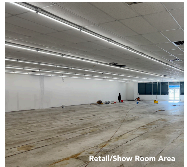
Retail/Show Room Area