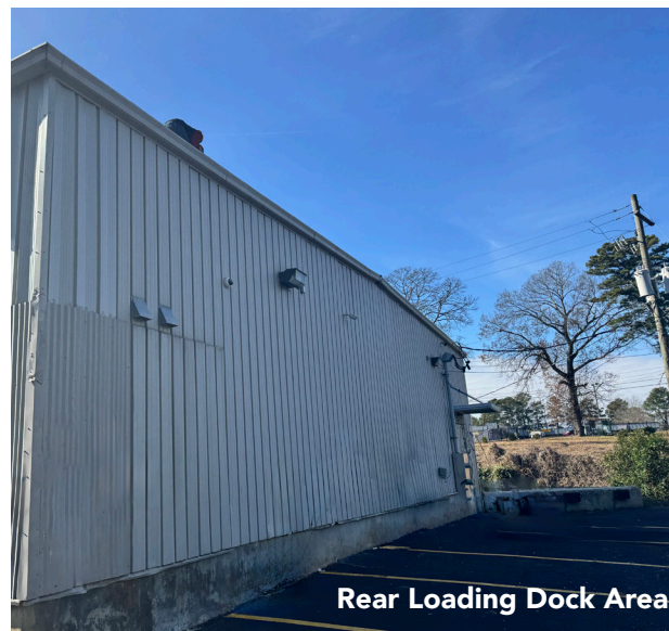
Rear Loading Dock Area