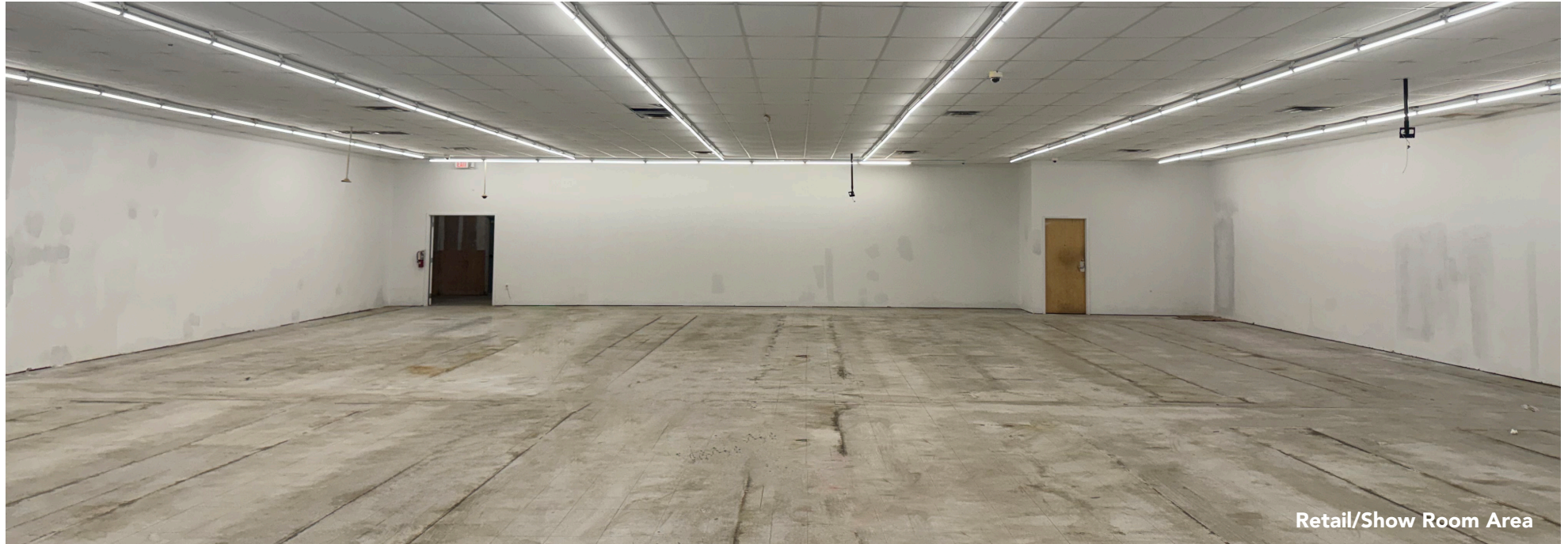
Retail/Show Room Area